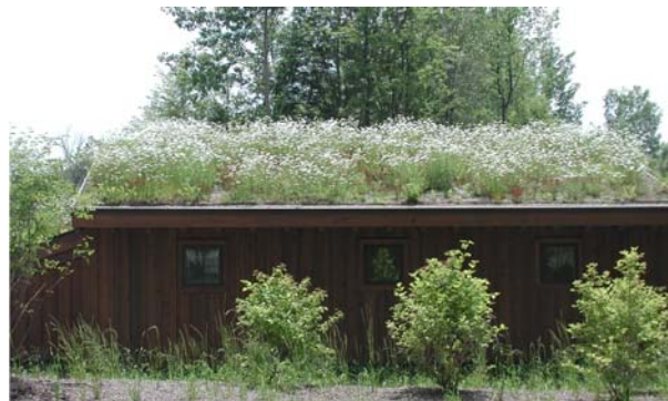
Westwood Nature Center, Geauga County, OH