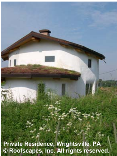
Private Residence, Wrightsville, PA