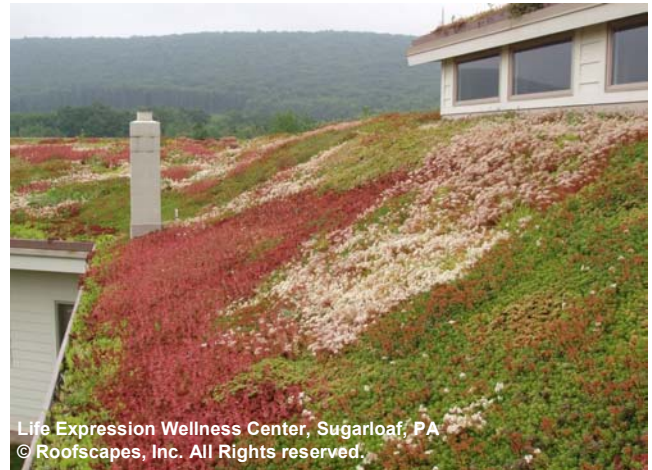
Life Expression Wellness Center, Sugarloaf, PA

The profile of a Roofmeadow® Flower Carpet assembly is as follows: Wind Erosion Stabilization System ♦ Lightweight Growth/Drainage Medium ♦ Roofmeadow® Moisture Management Mat ♦ Slope Stabilization Systems (for pitched roofs) ♦ Root Barrier Membrane (when required) ♦ Waterproofing